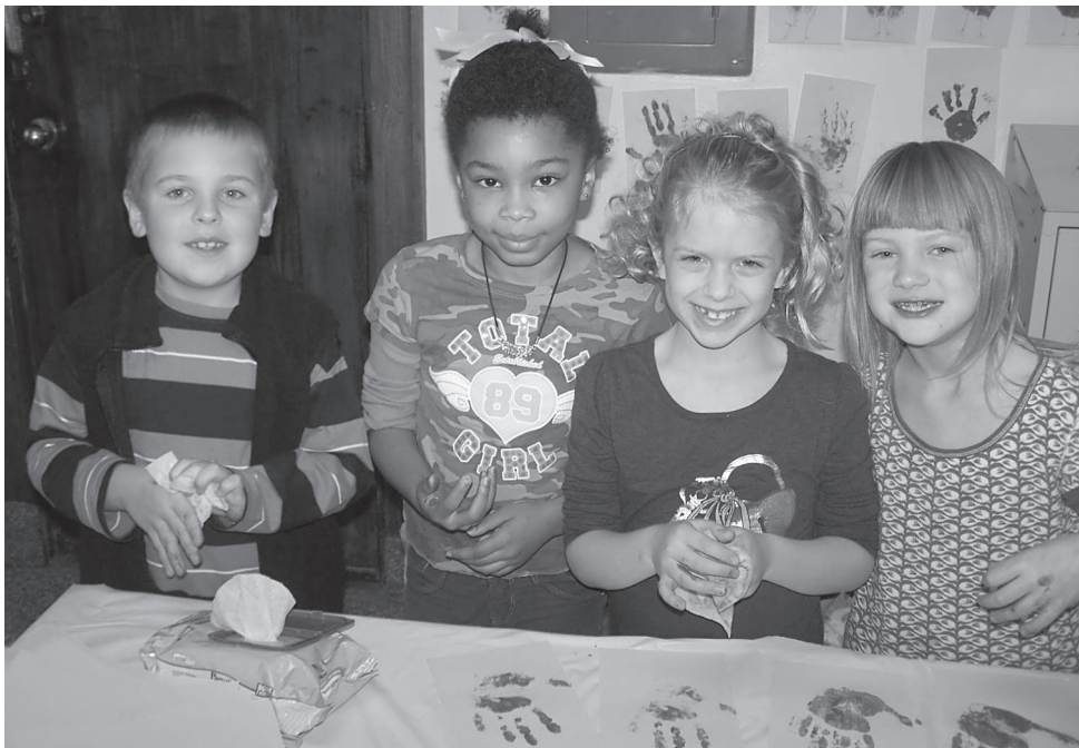
First Eucharist class making cards for Thanksgiving baskets

"Be vigilant at all times and pray that you have the strength to escape the tribulations that are imminent and to stand before the Son of Man." - Lk 21:36