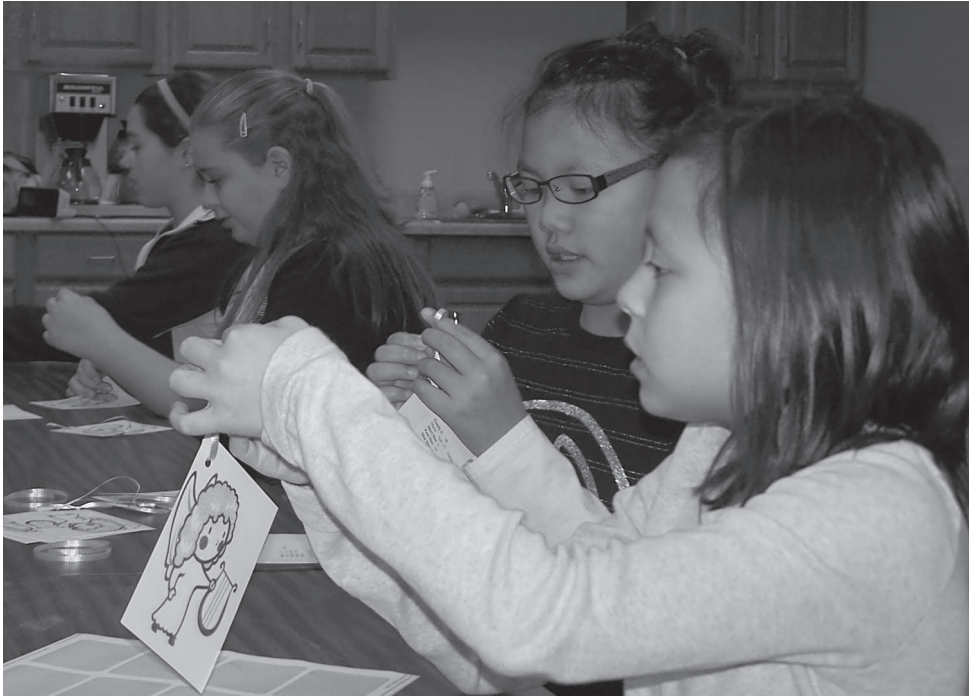
5th & 6th graders preparing Angel Tree cards

Could you help make Christmas special for families in need? Please take a card from the Angel Tree and follow the directions on the back. Return gifts by Sunday, December 13. Thank you so much!